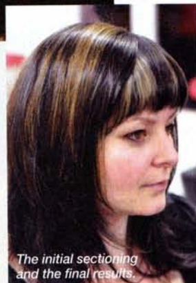
The initial sectioning and the final results.